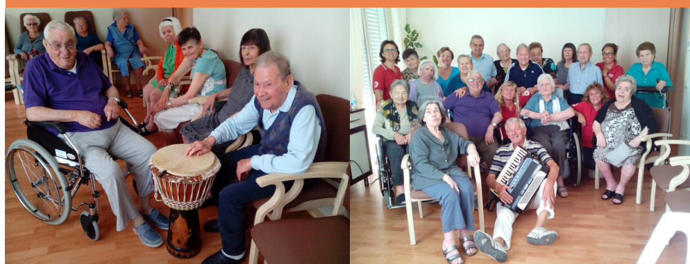
Activities with the elderly

Croce Rossa Italiana Comitato di Marotta-Mondolfo