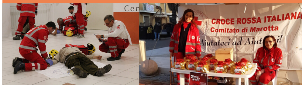
First Aid Course