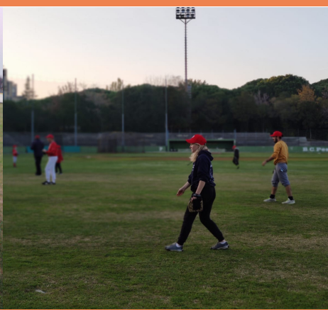
Playing on the field