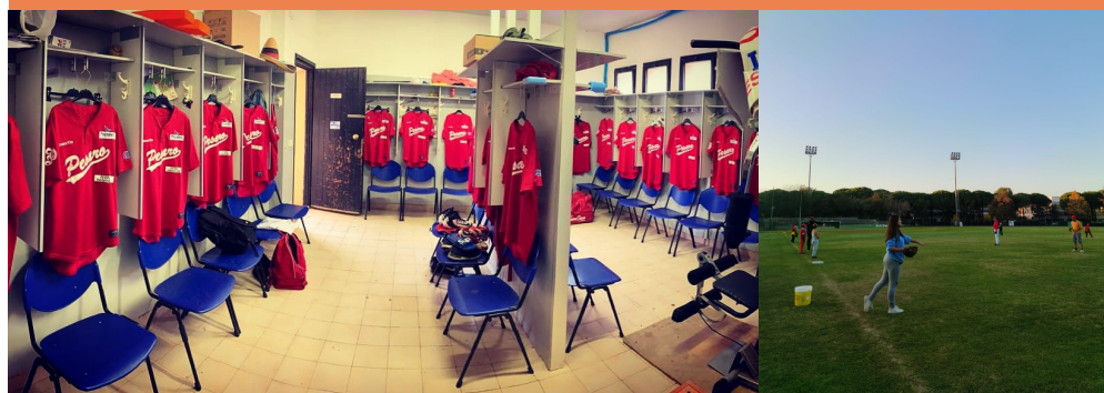
The changing room