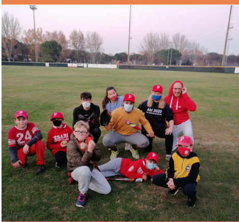
The children at the Baseball Club