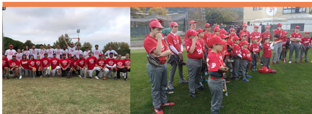
Some of the members of the Club